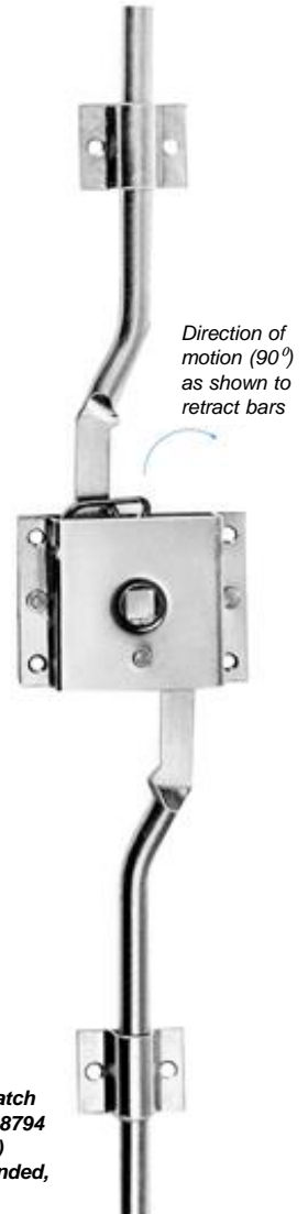
Right-hand rod latch system GC35-G18794 (includes guides) shown fully extended, from inside

Note on 'handing' Sketch shows right side latch in position on interior of door which is hinged on its right-hand edge (when viewed from outside).